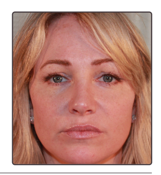
FACIAL REJUVENATION