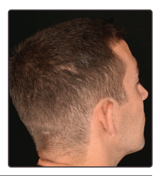
HAIR RESTORATION